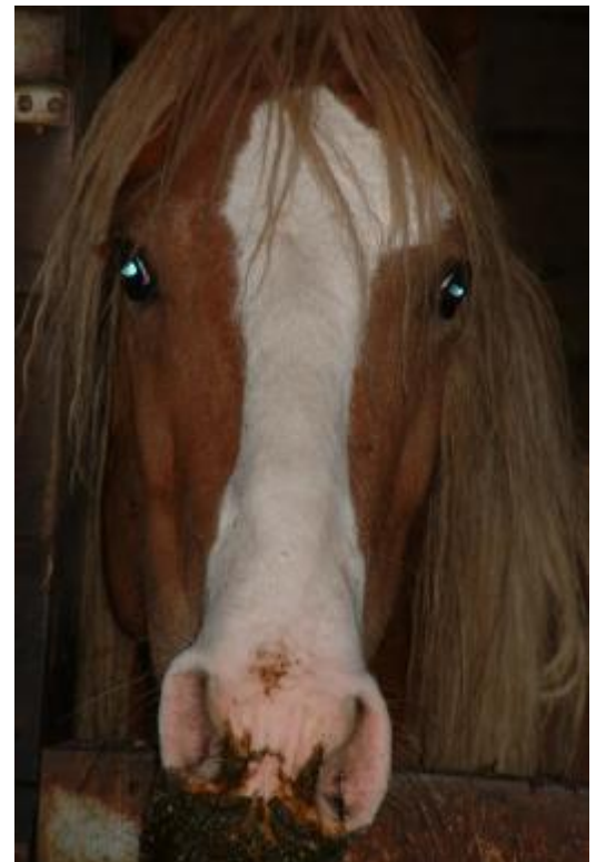
FEEDING TIME AT HONEYMOON COTTAGE!!!